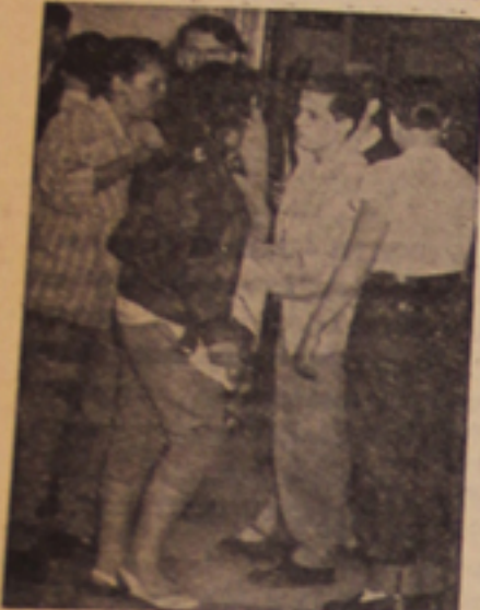
A "He-She" Meet

The scattered sisterhood of Sappho has found a happy hunting ground in Toronto's Chinatown, where they have fashioned a modern Isle of Lesbos, thus combining two ancient cultures in a blend that sadly enough contains little of Confucius and Plato but plenty of the off-beat sex lore of ancient Greece and the poppy dreams of the forbidden city of Peking.